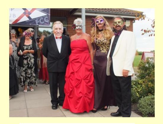
Who's behind the masks?

What a wonderful time we had at our Masquerade Ball at Normanton Village Hall – the venue was ideal for all members as we had a lovely flat field to site our caravans and motor homes and it was less than a five minute walk from the River Soar and moorings outside the Plough. I'm sure we will use the hall again.