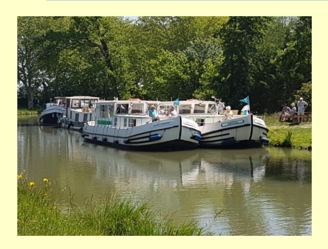
Our boats Amiens and St Sernin