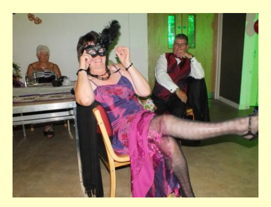
This belle of the ball was having fun